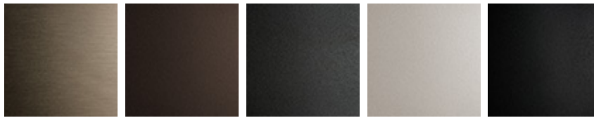
11 satin titanium