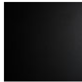
OP17 matt black