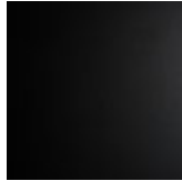
OP17 matt black