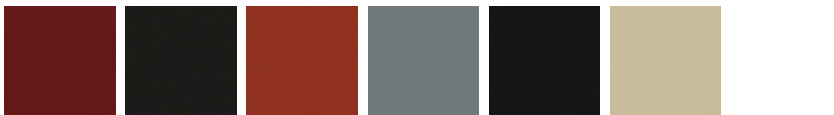
89 ROSSO CORSA