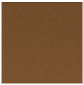
GF15 bronze embossed