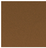
GF15 bronze embossed