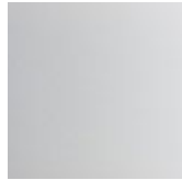
GFM71 white embossed