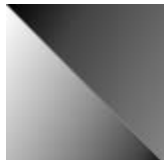
clear w/frosted edge