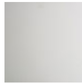
OP71 matt white