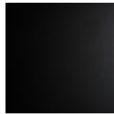
0P17 matt black