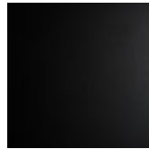
OP17 matt black