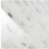
BC polished white Carrara