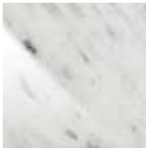
BC polished white Carrara