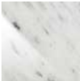
BC polished white Carrara