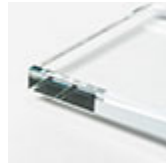
extra light transparent