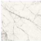
KM24 matt Invisible