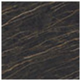
KM07 matt Portoro