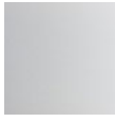
GFM71 white embossed