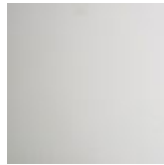
OP71 matt white