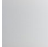
GM71 white embossed