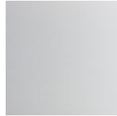
GFM71 white embossed