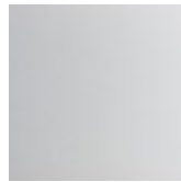
GFM71 white embossed