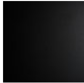
0P17 matt black