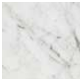
BCO matt white Carrara