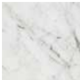
BCO matt white Carrara