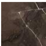
EBO matt Ebano