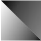
bevelled extra clear