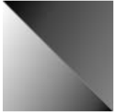
bevelled extra clear