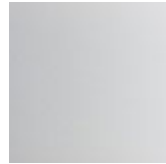
GFM71 white embossed