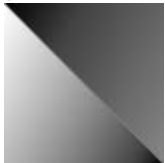
bevelled extra clear