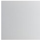
GFM71 white embossed