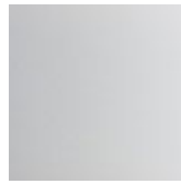
GFM71 white embossed