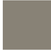
OP30 matt grey