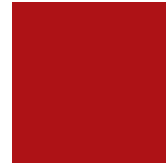
OP89 red corsa