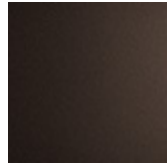
GFM18 bronze embossed