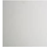
OP71 matt white