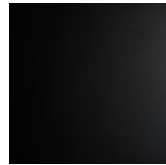
OP17 matt black