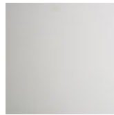
OP71 matt white