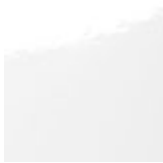
L7 polished white lacquered