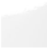
L7 polished white lacquered