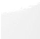
L7 polished white lacquered