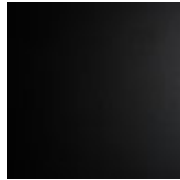
OP17 matt black