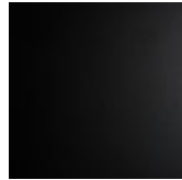
OP17 matt black