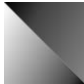
extra clear graphite