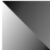
extra clear graphite