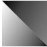
extra clear graphite