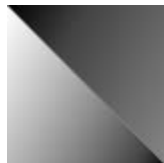
extra clear graphite