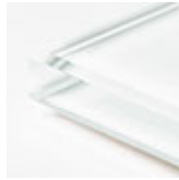
extra clear frosted glass white painted