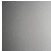
14 silber met