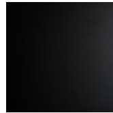
OP17 matt black