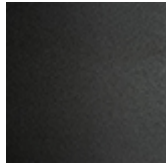
GF69 embossed graphite