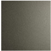
GF11 titanium embossed