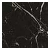
NM polished black Marquina