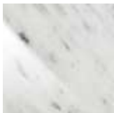
BC polished white Carrara