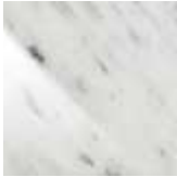
BC polished white Carrara