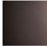
15 satin bronze