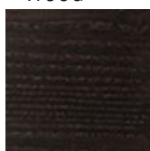
W2 dark wenghè