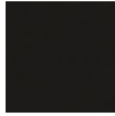
91 TESTA DI MORO