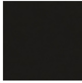
91 TESTA DI MORO