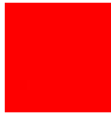
L8 polished red