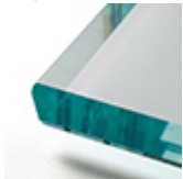
bevelled extra clear