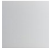
GFM71 white embossed