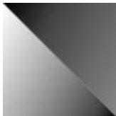
extra clear graphite