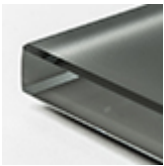
extra clear graphite