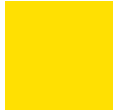
0P06 matt yellow