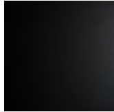
0P17 matt black