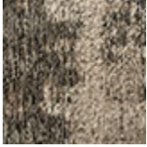
cotton chenille Darwin