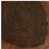
Mdf veneered in log section of walnut