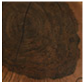
Mdf veneered in log section of walnut