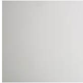
OP71 matt white