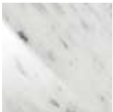
BC polished white Carrara