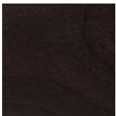
FW dark wengè stained beech