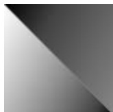
fr73 open pore matt black ashwood