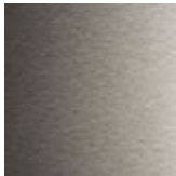
satine stainless steel