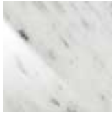
BC polished white Carrara