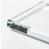
extra light transparent