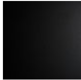
OP17 matt black