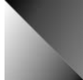
extra clear graphite