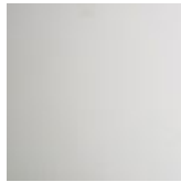
OP71 matt white