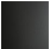
OP69 matt graphite