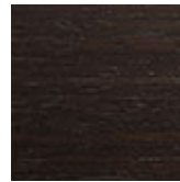
frRB burned oak stained ashwood