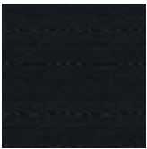
fr73 open pore matt black ashwood