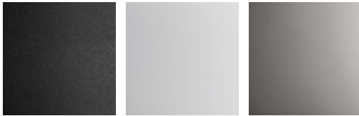
GFM69 graphite embossed