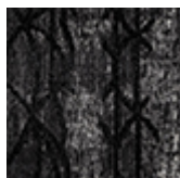
cotton chenille Mumbai