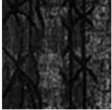
cotton chenille Mumbai