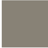
OP30 matt grey