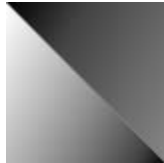
extra clear graphite